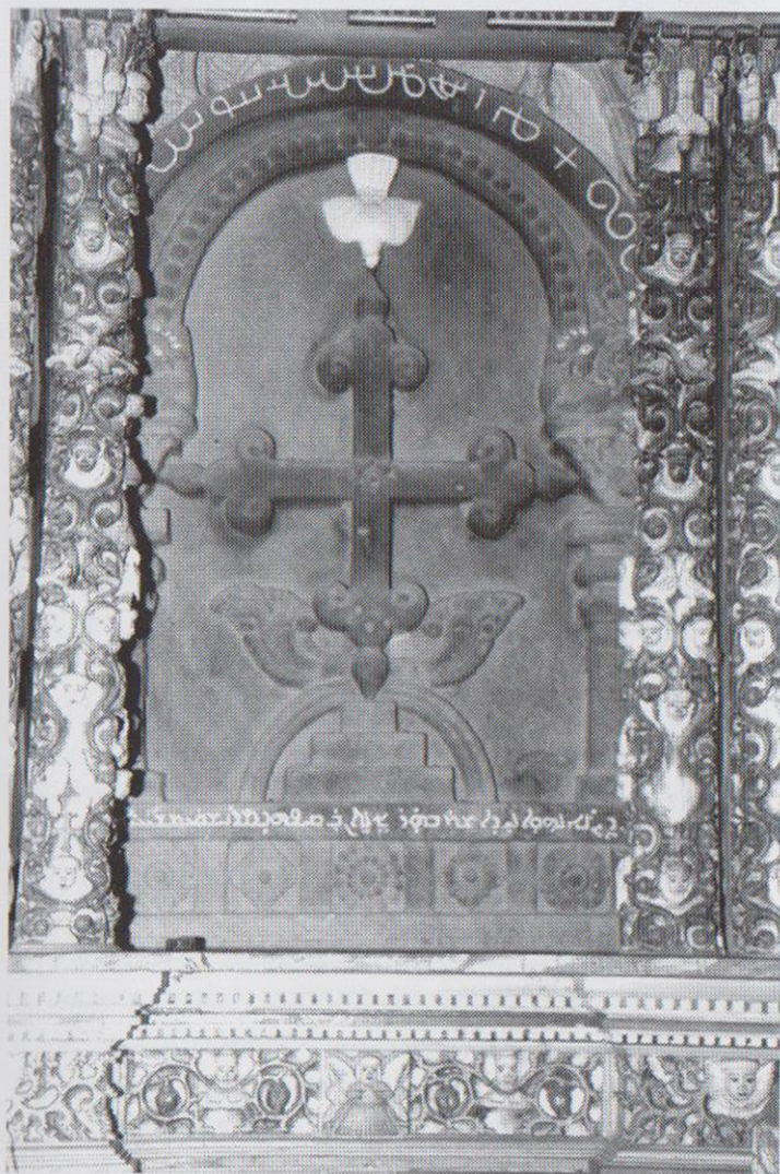
'Persian Cross' at Valiapalli, Kottayam (circa 7th century). Inscription on the sides in Sassanian-Phalvi or Old Persian and the inscription on the bottom (Gal. 6:14) in Syriac.