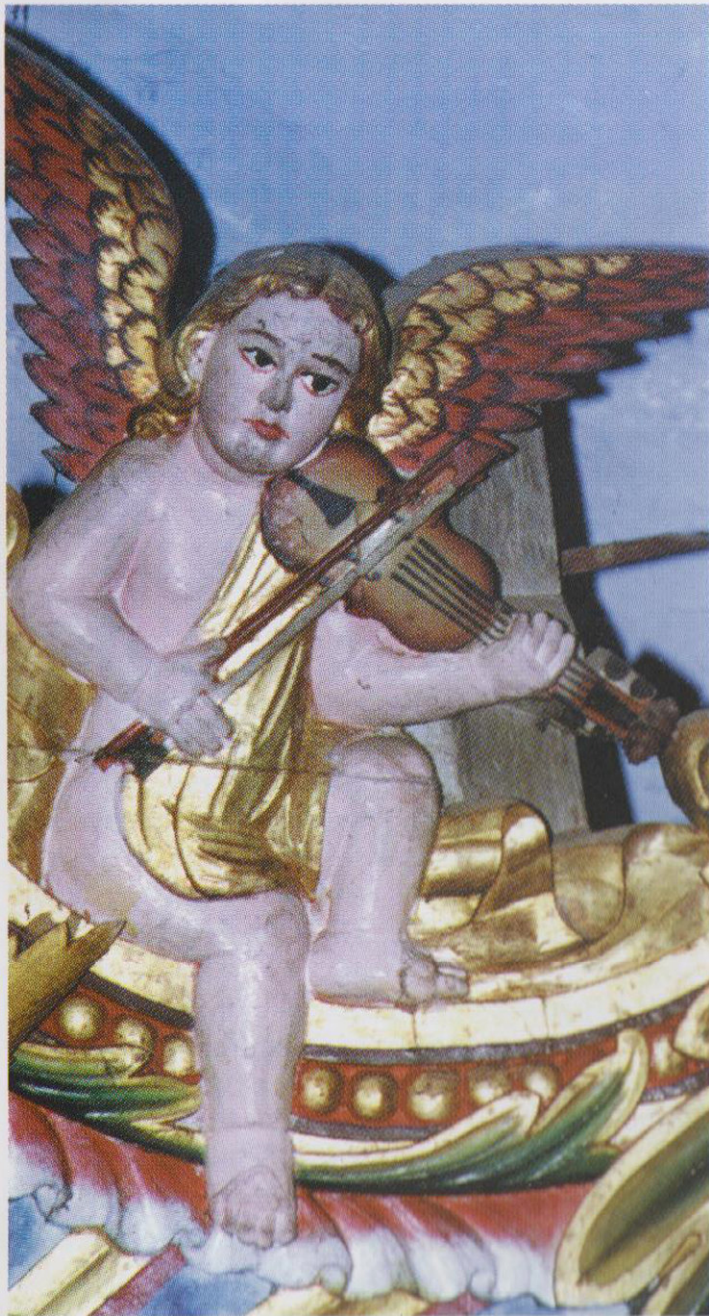
Close-up of angel on the wooden reredos of the main altar in St. Mary's Forane Church, Pallipuram, Cherthala.

C H R I S T I A N MUSICOLOGICAL SOCIETY OF INDIA